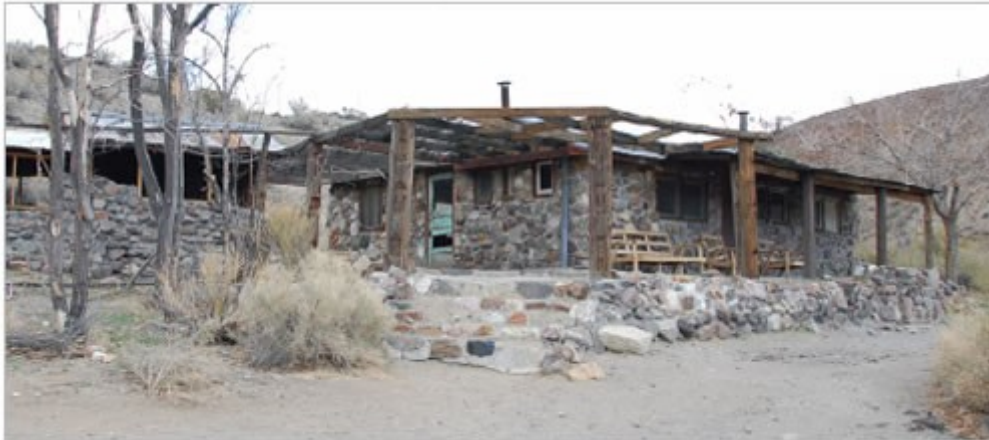
The main house at the abandoned Barker Ranch in Death Valley, where the Manson Family was apprehended in 1969. It is suspected that other murder victims may lie buried in clandestine graves near the house.