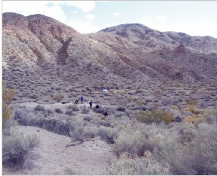
Human remains detector dogs have identified several potential clandestine graves on the arid grounds of Barker Ranch near Death Valley.